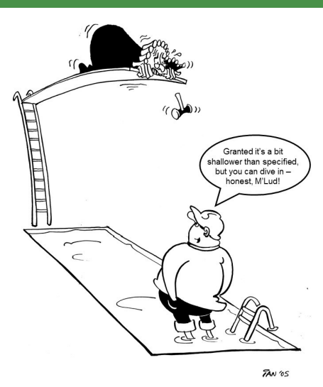
Fig 35: Compensation awarded for breach of contract may be less than the cost of correctling the work.

Copy-Editing/Proofreading: Certificate of Competence, Chapterhouse Editorial Skills, Exeter (2003). Architecture: University of Strathclyde , Glasgow. RIBA Part 3 Professional Practice Qualification (1991).