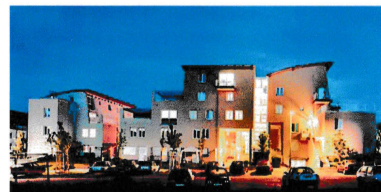
Above Berlin Free University model; Wiesbaden social housing (1992-96).